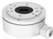
DS-1280ZI-XS Junction Box