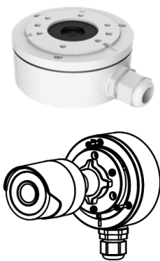
DS-1280ZJ-XS Junction Box